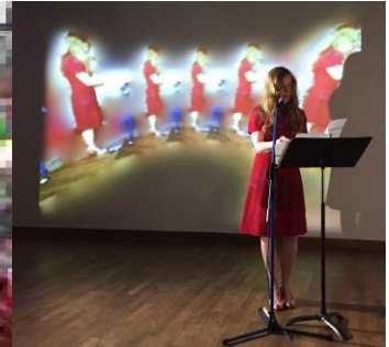
The Freddy McGuire Show (performance)